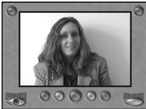
Interactive Interface Displaying Witness Deposition.

Faces and names on images have been deliberately obscured or changed for the confidentiality of witnesses.