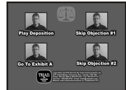
A DVD Legal Video interface.

Give us a call and we'll find a solution to meet your goals.